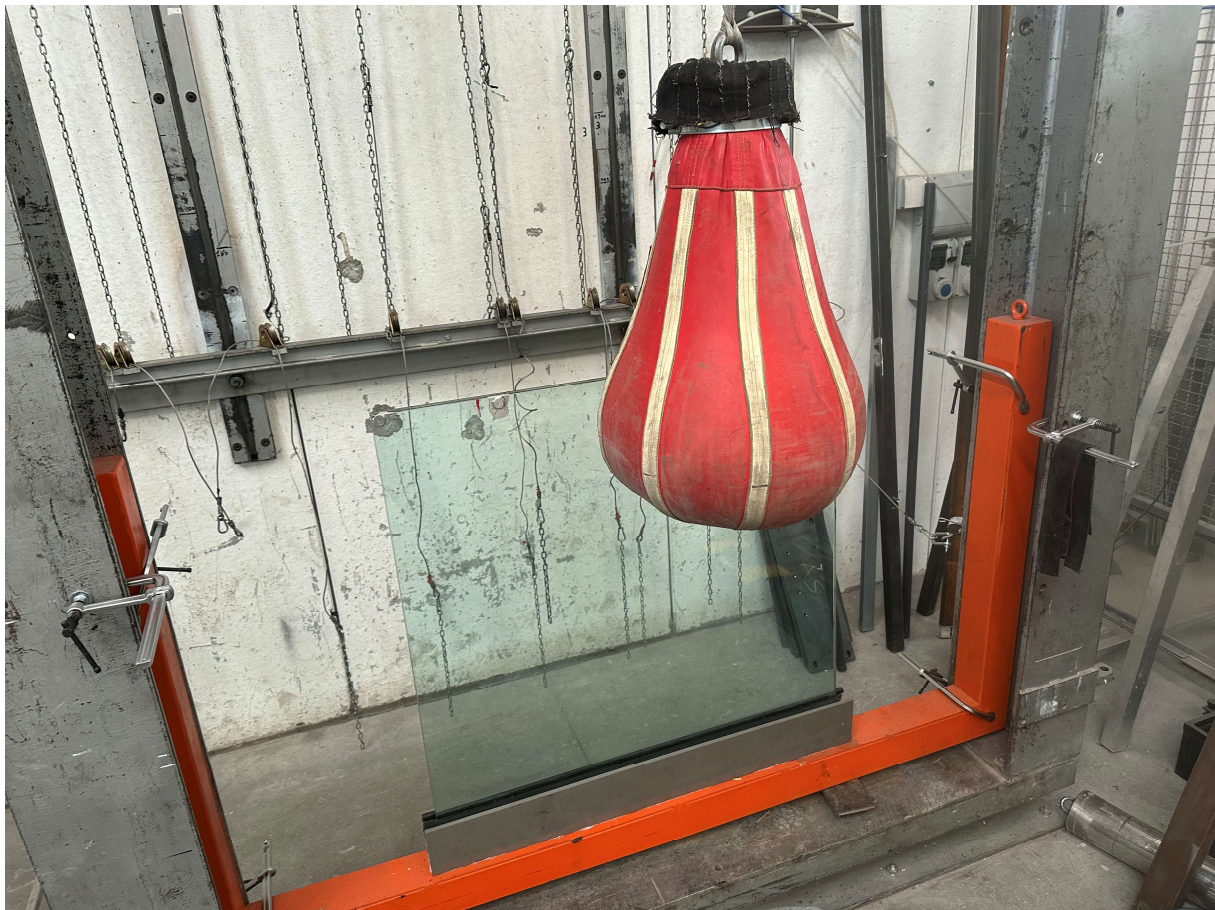
Photograph of the item after the impact to the edge