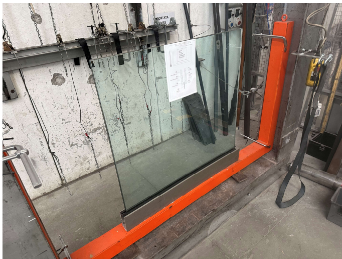
Photograph of the item

Further details of item specifications in annex "A".